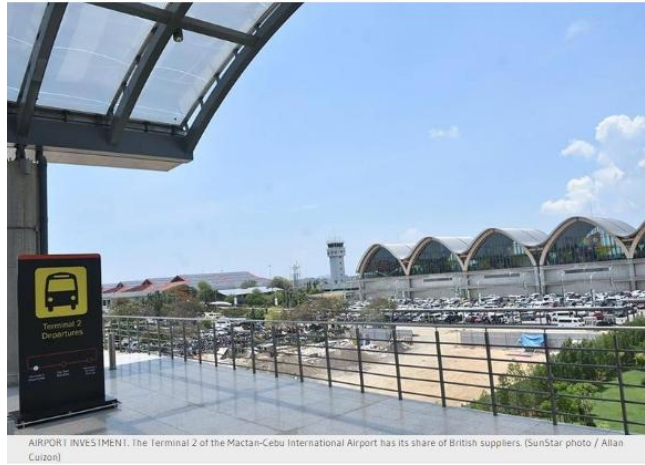
AIRPORT INVESTMENT: The Terminal 2 of the Mactan-Cebu International Airport has its share of British suppliers.

BRITISH companies are looking to participate in the country's Build, Build, Build program.