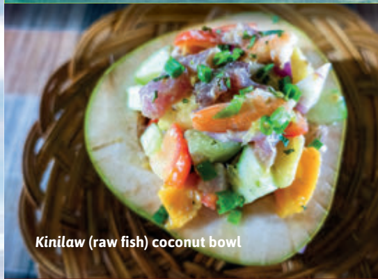
Kinilaw (raw fish) coconut bowl