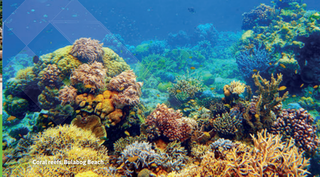
Coral reefs, Bulabog Beach

Since its reopening, Boracay has become much more tranquil, with a cap on visitor numbers and wild beach parties in favour of low-key activities and events. Dining is casual too – focused on the latest catch, often simply grilled. Think diwal (angel-wings clam), lobster, oysters, prawns and tuna in both Asian and globally inspired dishes.