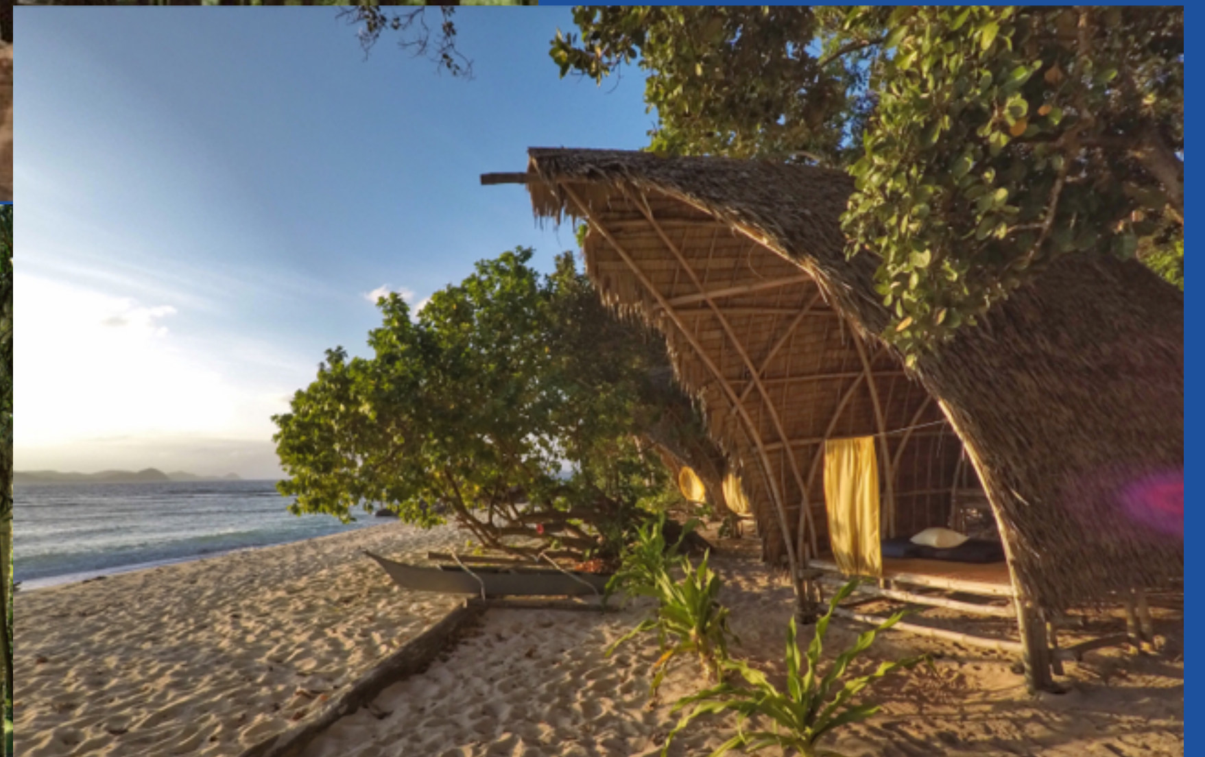
Tao Huts, El Nido