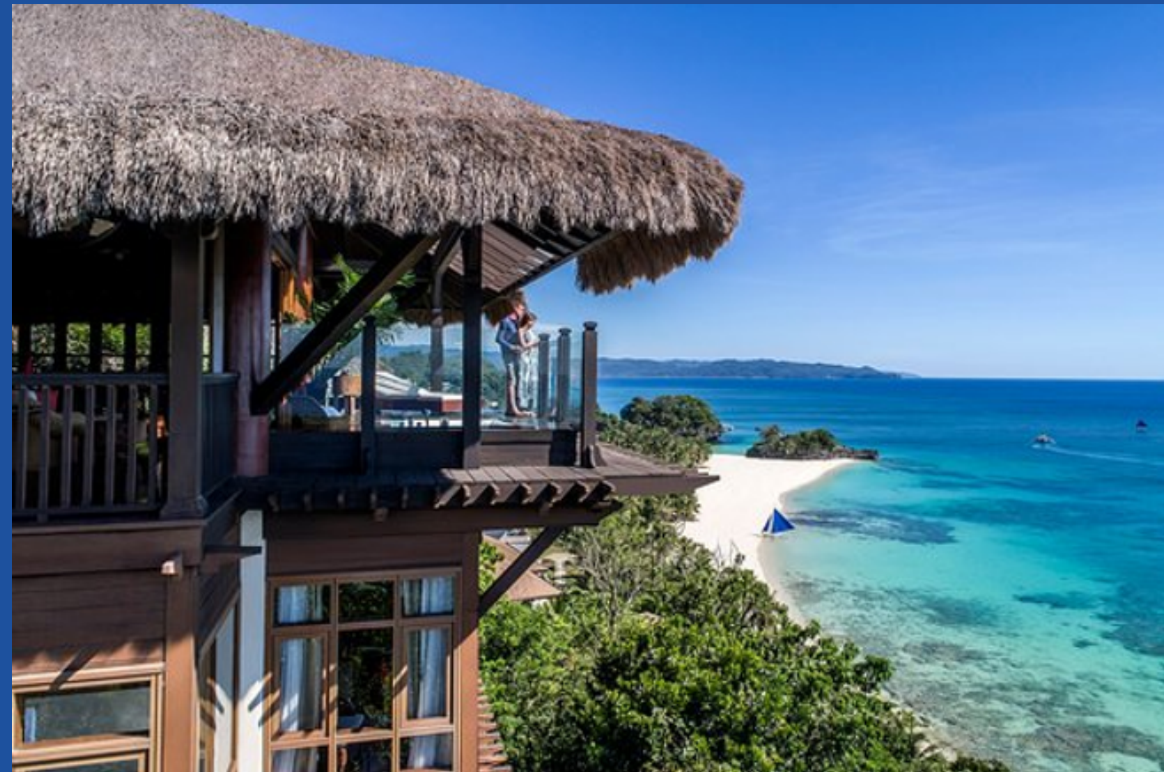
Shangri-La Boracay, Three House Villa