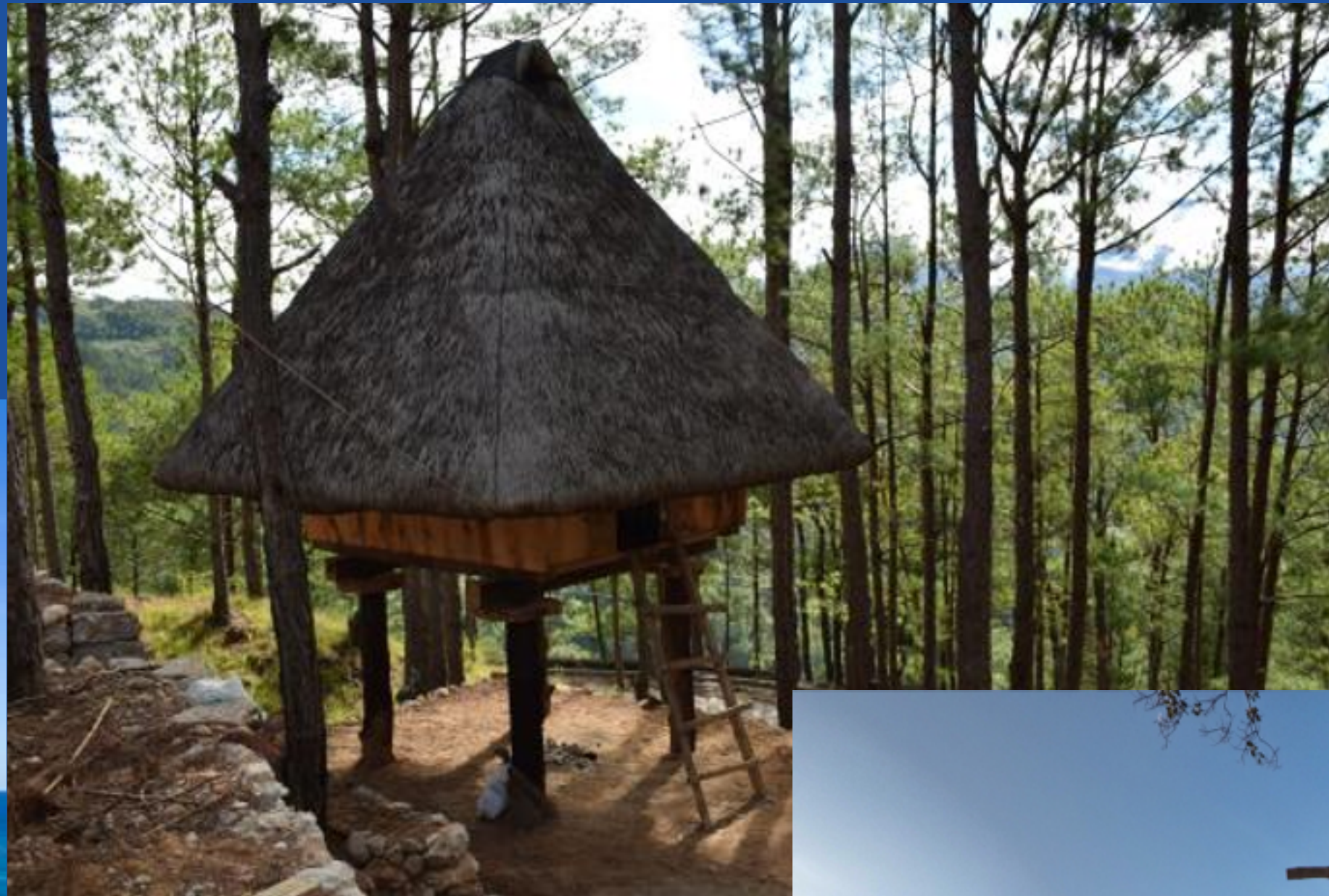
Ifugao Huts, The Cordillera