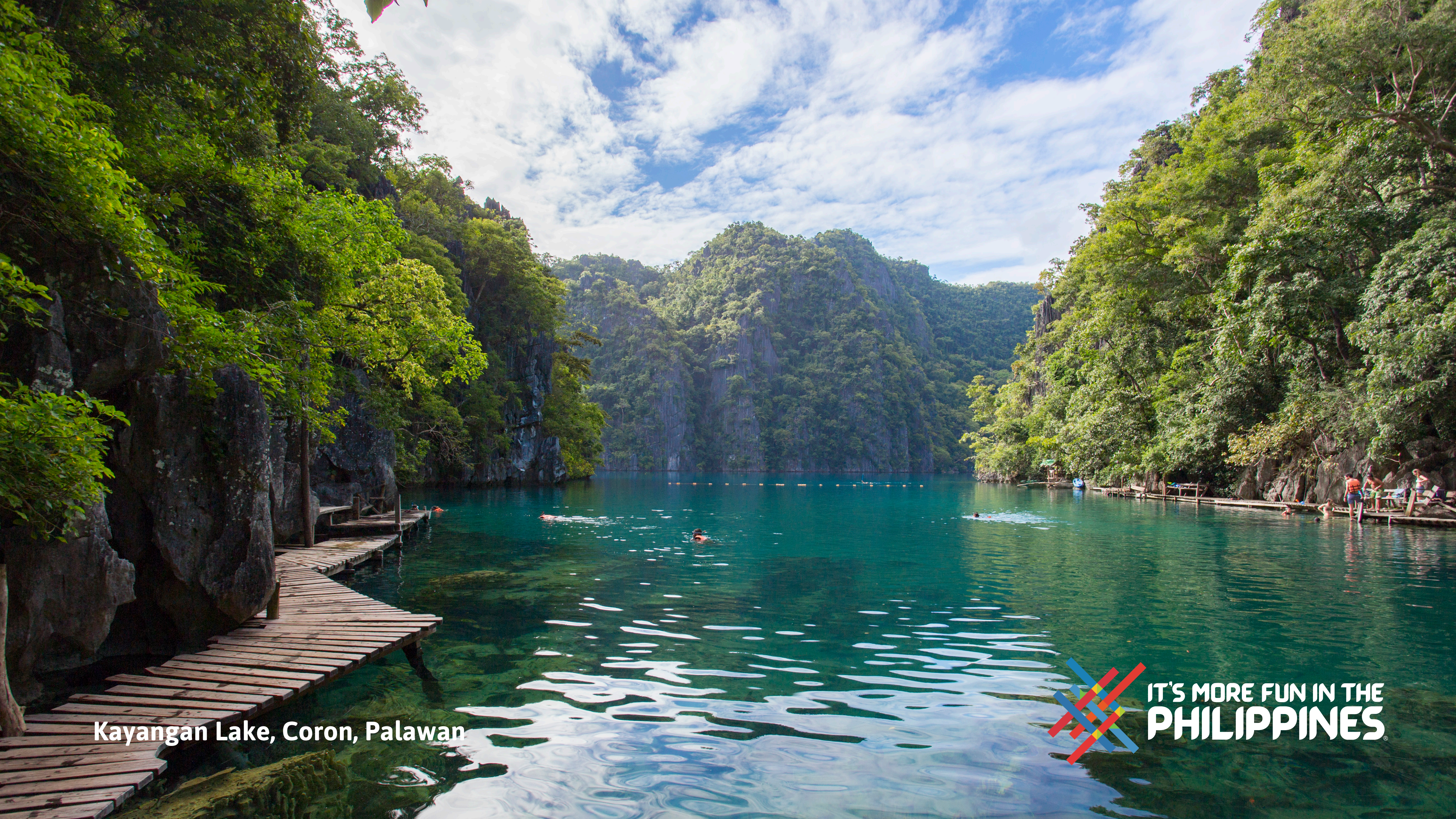
Kayangan Lake, Coron, Palawan