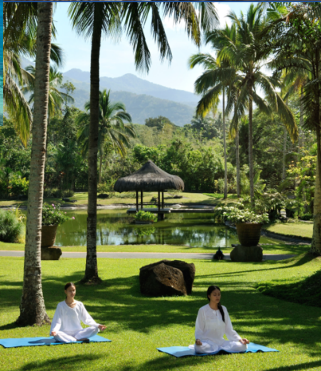
The Farm at San Benito