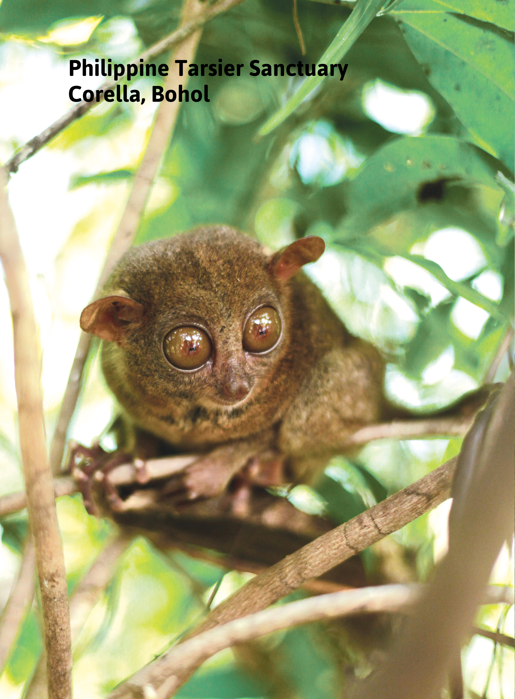
Philippine Tarsier Sanctuary Corella, Bohol